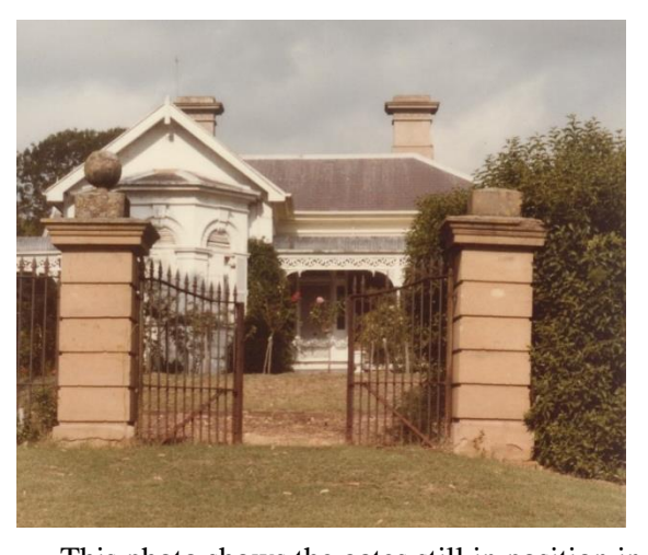
This photo shows the gates still in position in Sowerby Street outside Atherstone. Photo cropped from MSL&FHS photo 1217.1

The above photo shows the gates to the south of the first section of Campbell's Store erected in Bridge Street. When a further section was erected to the south the gates were moved further south but later they were dismantled and moved to Atherstone, the residence of Mr John Watts Humphries, a principal of M Campbell & Co.