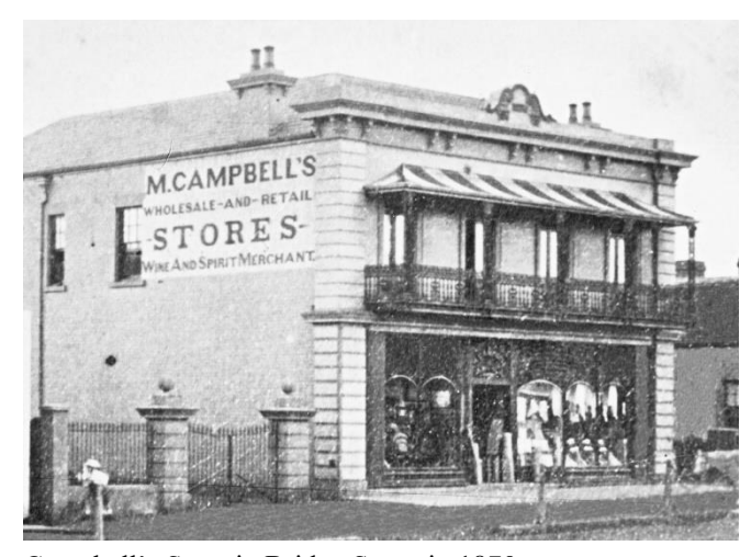
Campbell's Store in Bridge Street in 1870 Cropped from MSL&FHS photo D0866