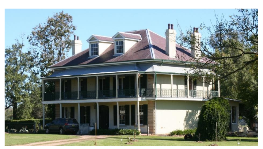
Balmoral Homestead MSL&FHS photo F3 supplied by Lionel Ahearn