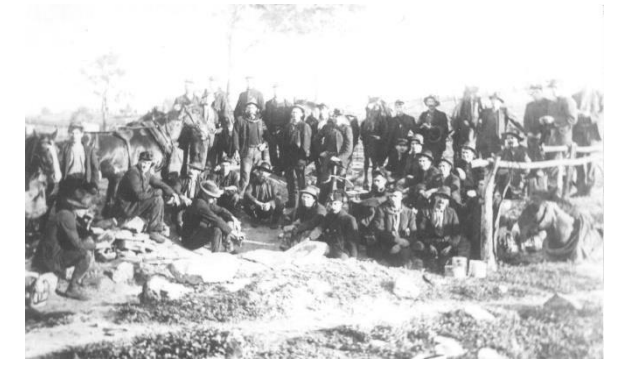
Sinking the first mine shaft 1907 MSL&FHS photo 0622

Many of the visitors also enjoyed a bus trip to view the mine site and the massive equipment that was used at the end of the mine's life. The following photos give an indication of the progress since 1907.