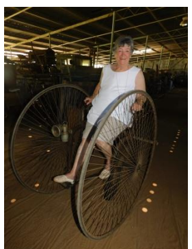
Another mode of transport