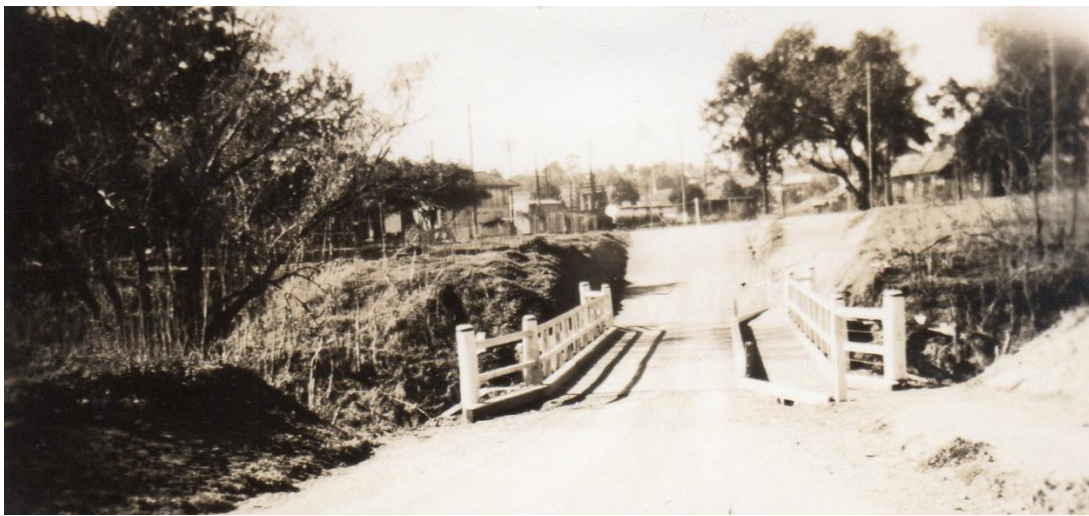
Original low-level bridge over Muscle Creek.

The plan required Council gaining ownership of land to create a street, later named Haydon Street. This would allow the community to gain access from Lorne Street and Sydney Street over the new bridge. The road leading to the new bridge was later named Wilkinson Avenue.