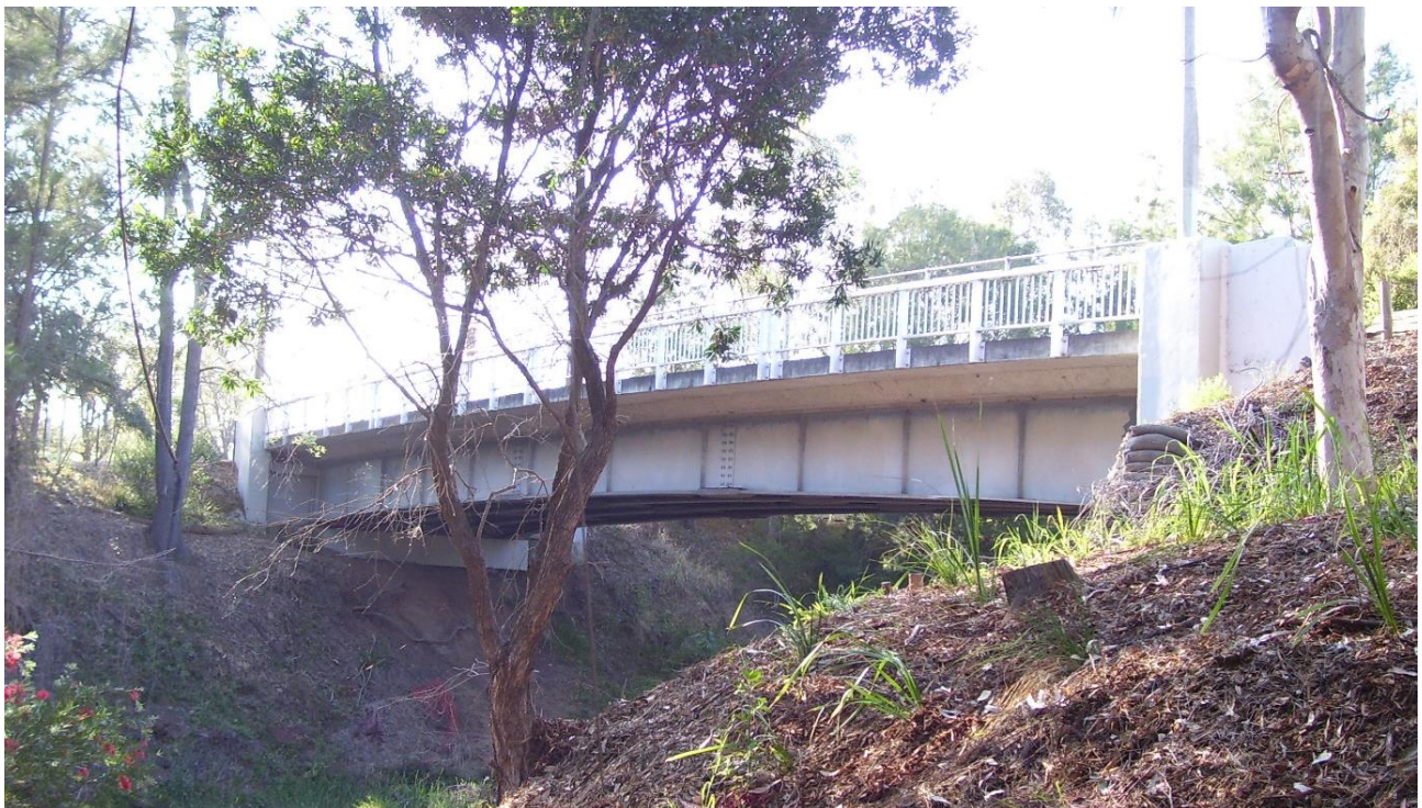
Wilkinson Street bridge from Muscle Creek.

The Council rejected the Town Clerk's suggestion of Olympic Way or Fitzgerald Way. After the usual advertisements in the local press did not prompt any objections the formalities resulted in Wilkinson Avenue and Hayden Street being gazetted on the 17 April 1973.