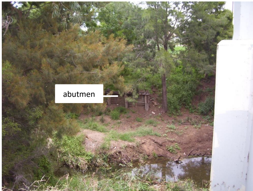
Original bridge abutment (centre) and railing 1972 bridge (right).