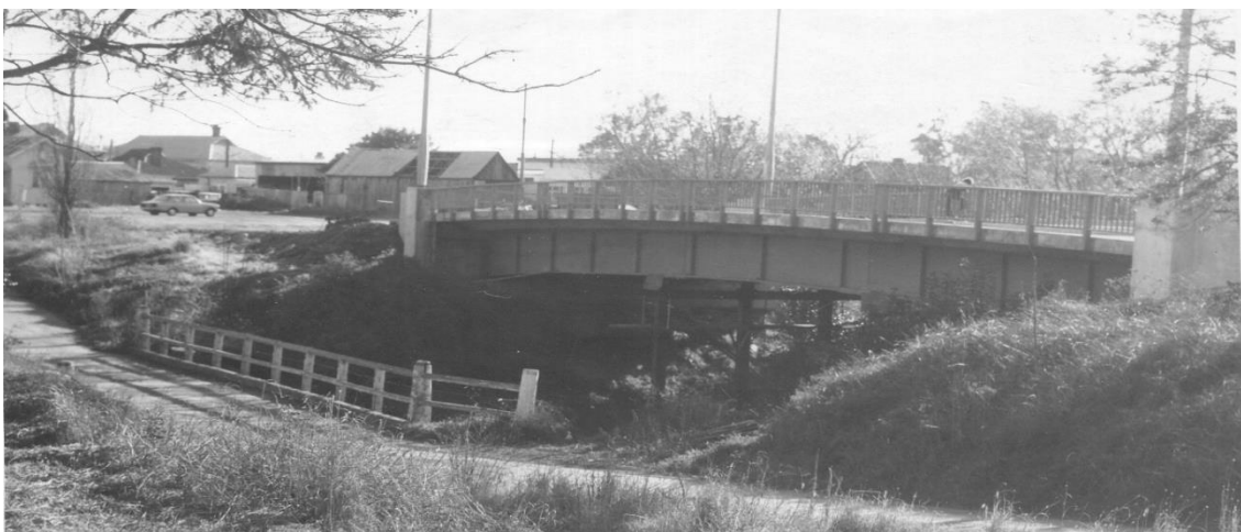
Bridge over Muscle Creek in Wilkinson Avenue Circa 1972 1

Council proceeded to build the lower-level bridge which was completed in 1947 and to construct the street between Lorne Street and Sydney Street, with access over the bridge to Gerald Park. A concrete high-level bridge downstream from the low-level bridge was erected 1972.