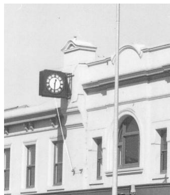
Clock showing winding rod at 45 degree angle.

This photo cropped from a Muswellbrook Council photo reminded me of a conversation I had with Jeff Wolfgang. He explained to me how the clock was wound. Apparently a hole was drilled through the brick wall and a rod was attached to another long rod which travelled up to the clock using an elbow from a shearing stand. This rod at a 45 degree angle can be clearly seen. A handle was attached inside when the clock needed winding. Jeff commented that he was given permission on one occasion to wind the clock.