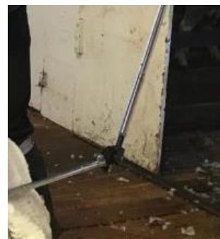
Shearing elbow as seen just outside wall

This photo cropped from a Muswellbrook Council photo reminded me of a conversation I had with Jeff Wolfgang. He explained to me how the clock was wound. Apparently a hole was drilled through the brick wall and a rod was attached to another long rod which travelled up to the clock using an elbow from a shearing stand. This rod at a 45 degree angle can be clearly seen. A handle was attached inside when the clock needed winding. Jeff commented that he was given permission on one occasion to wind the clock.