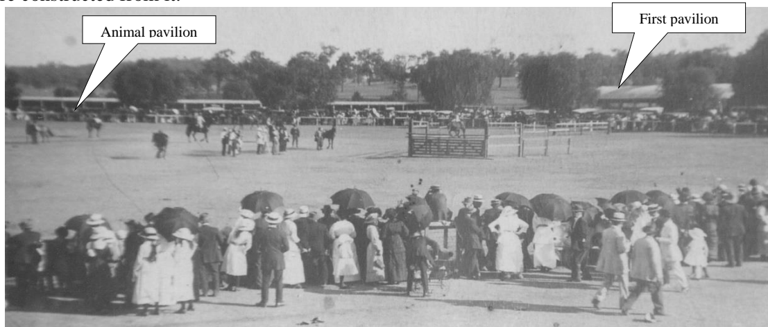
Society Photo 0569.05

As far as I can determine the photo above is the only photo in the Society collection which shows Wright's Wool Washing Establishment. The photo below shows the old showground with the pavilion and the animal shelters which were constructed from it.