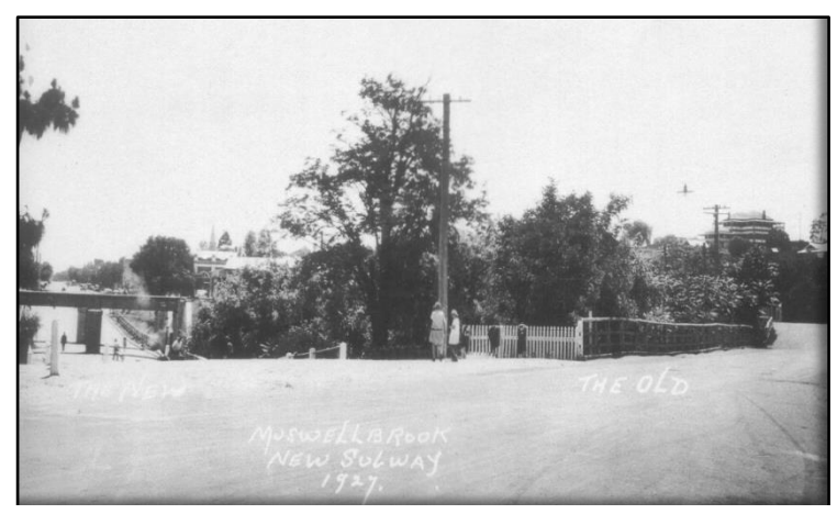
The new Subway is finished and open but the old bridge in line with Sydney Street still stands

After many years of agitation by the Muswellbrook Municipal Council, the Railway Commissioners agreed to the construction of a subway (or underpass as it is now known) under the railway lines.