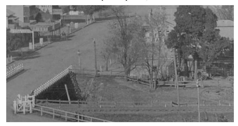
Photo showing a Kurrajong tree which may be the one described in story. Photo 0065.1

So, on the score of safety the tree, planted 60 odd years ago, is to go. The plan and specification, with the deletion of the part referring to the tree, were accepted on the motion of Ald. Purvis and Dobbin. (Council meeting 20 July 1927 reported in Muswellbrook Chronicle Friday 22 July 1927)