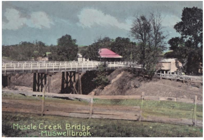
Postcard showing bridge over Muscle Creek. Society photo D2891

We hope that the council will be able to see its way clear to save the beautiful kurrajong in Sydney Street from destruction when the approaches to the low-level bridge are being constructed. We speak not only on our own behalf but for many residents who say it would be a tragedy to destroy the tree, which is looked upon as the most beautiful of its species, in this town.