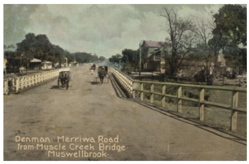
Bridge in line with Sydney Street MSL&FH Photo 0354

In the second half of the 19th century and the first part of the 20th century access from the area known as south Muswellbrook to north Muswellbrook was gained by crossing over a bridge at the end of Sydney Street, across Muscle Creek, then over the railway line, turning left through what is now known as Simpson Park then onto Bridge Street.