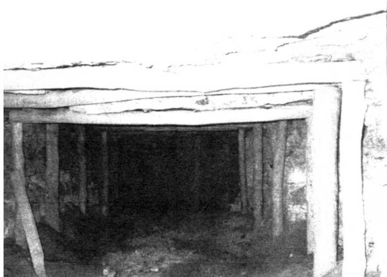
The Bayliss Tunnel

The Company's plan was to erect retorts and a refinery at Sandy Hollow and cart 100 tons of shale per week down from the mines. It had started production about the middle of 1942 and production continued until August 1945, a period of just over three years of continuous production during which time 300,000 gallons of petrol would have been distilled and sent to Sydney.