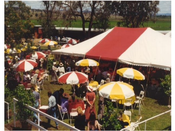
Skellatar Park Racecourse Society photos 2500.3 and 2500.4