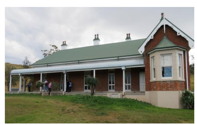
The 1890s addition with servants quarters in the roof cavity reached by a step ladder.

This addition from the 1890s has undergone extensive repair. The floor which had been laid directly on the ground had been completely eaten out by white ants. It was completely removed, soil was excavated to allow for an air gap and proper foundations and then the beautiful floor shown below was laid.