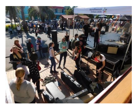
Music was supplied by bands in the fore court of the station