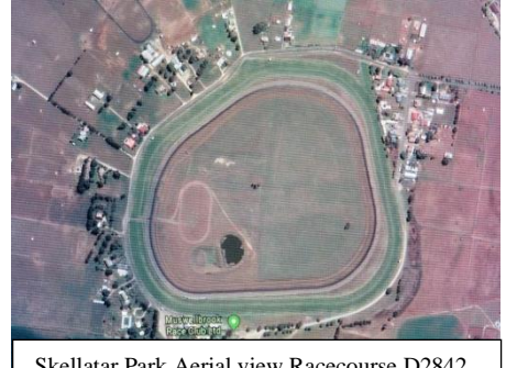
Skellatar Park Aerial view Racecourse D2842

meeting particularly since it has been regularly conducted on Melbourne Cup Day, making it a real gala affair.