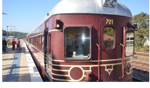
The two carriage locomotive loaded and ready to leave for Denman