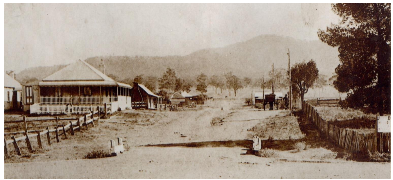
Ogilvie Street, Denman c1900 about the time Wickham's Store opened across from where Denman Hotel stands today. Photo 2534.1

In 1909, nearly 14 years ago, a new store opened, and commenced business in Denman. The town then was nothing like it is to-day. A few houses, a couple of hotels and a small shop or two grouped themselves on the bank of the Hunter River and promptly called themselves a town.