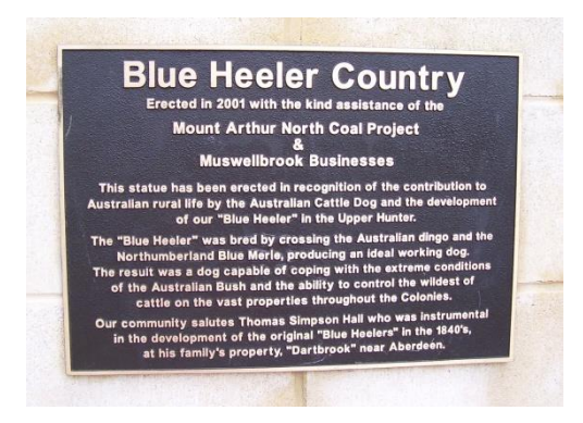
Caption on plinth

During 2001 a plinth was erected on Bridge Street on the north side of Hill Street (opposite Loxton House) to accommodate a large statue of a blue heeler cattle dog. The statue soon became a landmark in the town and a tourist attraction.