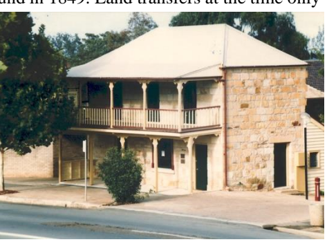
Society photo 381 as it stands today

describe the location of the land and not what was built on it. As David Brown never lived in Muswellbrook it is likely that the cottage was built after the purchase in 1849.